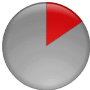
Broader Mount Gambier (Aug 2008)