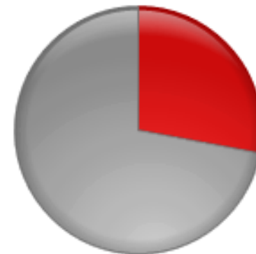
Broader Mount Gambier (Aug 2008)